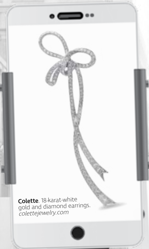
Colette. 18-karat-white gold and diamond earrings. colettejewelry.com

The mania for mixing and matching dainty earrings — studs, ear cuffs and huggies — has been displaced by the next big thing: supersize earrings. A pair of generously proportioned earrings never looks like an afterthought. Statement earrings are ready-made for dressed-up, festive occasions and give casual clothing a more sophisticated attitude. Their styles may vary, from sculptural hoops to ear climbers and chandeliers, but a "bigger is better" ethos is what unites the most striking earring designs of the moment. And they're just as easy to admire across a crowded room as in an Instagram selfie, which is no small thing. By Tanya Dukes