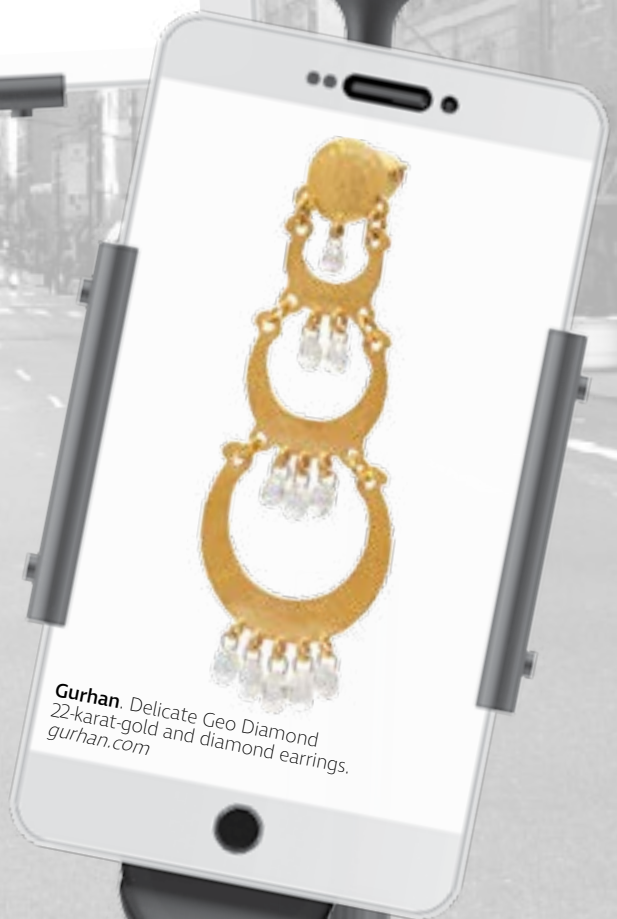
Gurhan. Delicate Geo Diamond 22-karat-gold and diamond earrings. gurhan.com