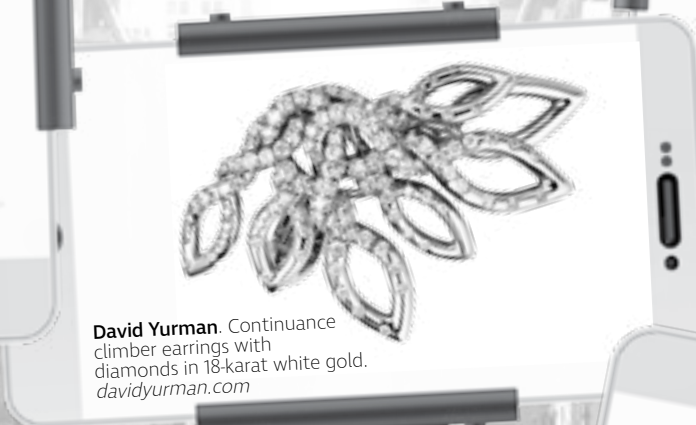
David Yurman. Continuance climber earrings with diamonds in 18-karat white gold. davidyurman.com