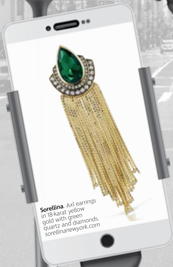
Sorellina. Axl earrings in 18-karat yellow gold with green quartz and diamonds. sorellinanyork.com